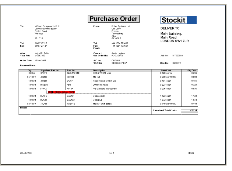
The Purchase Orders form can be fully customised using a custom template

The new Custom Report feature allows various options to be configured and managed - the use of built-in reports or custom reports. Once a custom report has been decided on, you are able to use or edit the custom report template to your own requirements.